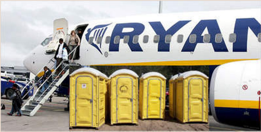
Port-a-loo toilets near a RyanAir aircraft at Shannon Airport, Irish citizens would still need to pay £1.25 pp+ VAT to use the facilities

The Falklands are still under consideration, pending approval from Mr Trump who is not sure there are lucrative NHS outlets there. Mr Johnson said there will be no greenspaces given, “just areas with useless b@@@@@ds who would be taken seriously in the U.S. because of their British-like accents” Dominic Cummings, who caused a stir by deliberately carrying a #VoteLeave canvas bag as he entered Downing Street, said he had no say in the choice of areas on offer to the U.S. President, who is also a property tycoon, insisting he only advises on election-related matters. Michael Gove, Chancellor of the Duchy of Lancaster offered school playgrounds that he couldn’t sell in 2012.