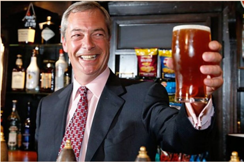
Not Charity: Brexit Party Limited is now public and shares will be available for the public, company employees will not allow Labour to confiscate any company shares describing McDonnell's suggestion as "Communist blabber"

High Holborn, London - In an interview with City AM, Brexit Party Leader Nigel Farage announced yesterday his new campaign #BrexitMeansBusiness. Farage confirmed the Brexit Party has now gone public and shares are available to trade at the London Stock Exchange from Thursday.