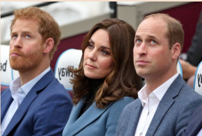
Eye on the throne: William looks with fear, while Harry is clearly yearning for it, thinking: 'the throne would be as good for #MeToo', the Duchess of Cambridge, middle[ton], has had enough of it all.