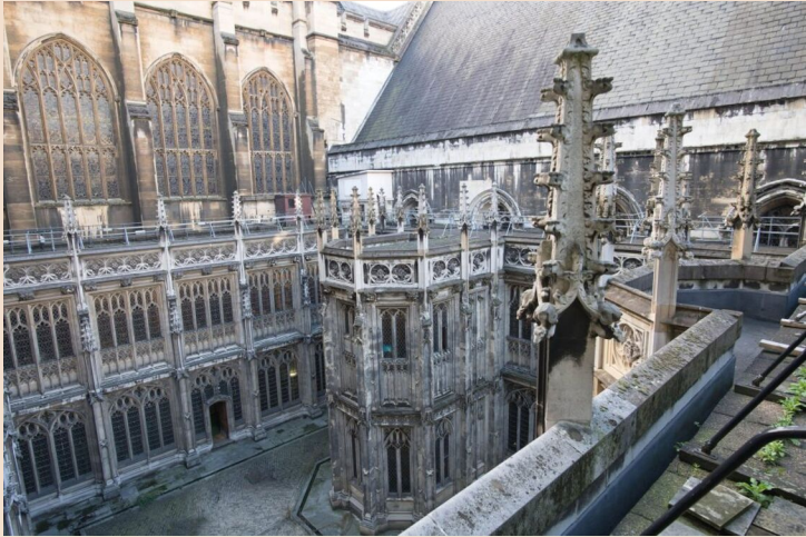
Opposed Eviction: Leader of the Opposition Jeremy Corbyn has always been a supporter of Squatters' rights, long before it applied at the House of Commons too...

The leader of the opposition has yesterday tabled a motion to enact a bill that allows tenants to buy property when their landlord is unavailable, rogue, or negligent. Corbyn received letters from tenants in a property previously occupied by the Prime Minster. The letter included harrowing details of the property including stains on the sofa, thought to be from a revenge sofa attack by his current partner Carrie Symonds. The letter states that this attack happened when a livid Symonds came back from the US embassy “fuming” and drained a whole bottle of Cabernet Sauvignon by Asda on Johnson’s sofa. Symonds has been rejected a US visa based on her peculiar visit to Somaliland, although she Insisted she was there for a hen do. A spokesperson for US President Trump said she was a loser and didn’t think the PM should be with her. Corbyn gave an interview to Hamas TV in Park Royal, explaining his sympathies towards Ms Symonds and his support for her endeavour to reach out to our brothers in humanity out in Somaliland, putting her own life at risk. Reports from the land registry identified the new owner of Mr Johnson’s home as an ordinary looking bus driver with a very dense foreign accent. When asked, Corbyn explained it was “my mate from Venezuela, Comrade Nicolas Maduro”.