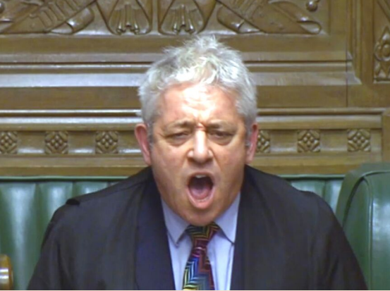
#Bercoff: House Speaker's had enough

Global Britain strategy, hoping it would help him secure a Foreign Secretary role when Theresa May is back as Prime Minister and leader of the Conservative Party, “now that John has Berc-ed off”.