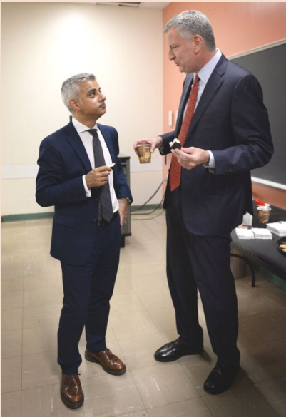
Donots Trump: Sadiq Khan, who is also Mayor of London, asking NYC Mayor De Blasio to fly a Boris Johnson Blimp on Wall Street

A waterproof canopy has been installed for the mayor with café-trottoir style heaters to keep him warm during the winter months where he is expected to be making statements on London air pollution detectors, future Trump visits, and a new AI technology that will manipulate Londoners to vote in certain ways in reaction to coded stimuli he broadcasts from his rooftop control centre. Immigration Policy in London is now quota-based, algorithms will be used to ensure that high-performing graduates coming from other countries or British towns will not outnumber mediocre or low performers. Other categories in the quota include income, parental profession, size of their childhood home, and the supermarket class they belong to.