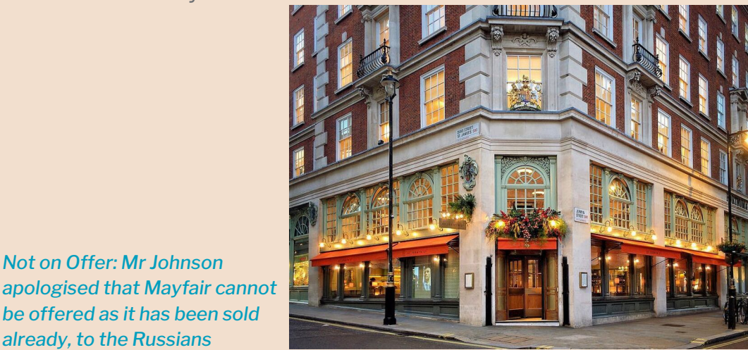
Not on Offer: Mr Johnson apologised that Mayfair cannot be offered as it has been sold already, to the Russians

Foreign Policy: Labour promised to cut all ties with the US until they stop yacking on the tubes so obnoxiously, totally disregarding commuters; their brothers in humanity.