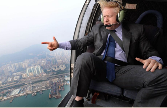
Conservative revolutionary PM Johnson will benefit for a 1.5 Bn special aircraft that would be superior to the US presidential plane Air Force One in terms of specs and gadgets. It is understood that the PM is building it himself - cool!

End of Austerity will include funeral type bullet-proof Jaguar limousines for the Leader of the House of Commons, Jacob Rees-Mogg, enabling a lie-down on longer trips, or those after 7PM.