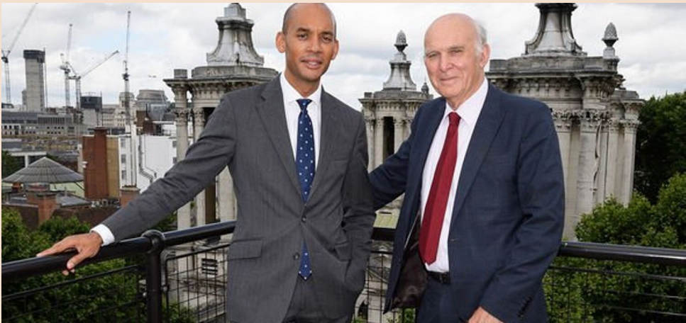
Inspired: Chuka Umunna and Former Liberal Democrat party leader Sir Vince Cable (where he is still a member as of Sep 2019)

The Liberal Democratic party, also known as the LibDems has been overwhelmed with a huge influx of applicants wanting to join, now that Jo Swinson is leader of the party, promising to overturn Brexit and put the United Kingdom in the EU “Where it Belongs”. Despite major confusion over whether Swinson is operating under a Tory lite agenda or one of her own.