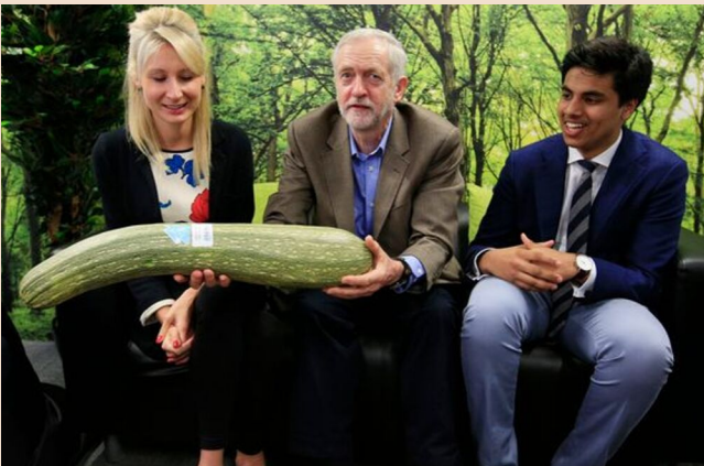
Size matters: Corbyn, who is also Leader of HM Opposition, explains to young graduates that sharing is caring

The General Elections 2019 Labour Party manifesto was revealed yesterday during Jeremy Corbyn’s visit to Doom & Bloom, a north London charity that looks after the unlooked-after, the many, not the Phew! Corbyn spoke for 25 minutes about the difference nutritional value between cabbages grown organically and those bought from capitalist supermarkets that prey on vulnerable farmers in Venezuela forcing them to grow genetically modified crops that are compatible with British mouth widths. Corbyn, spoke of the importance of feeding the youths so they have better prospects in life.