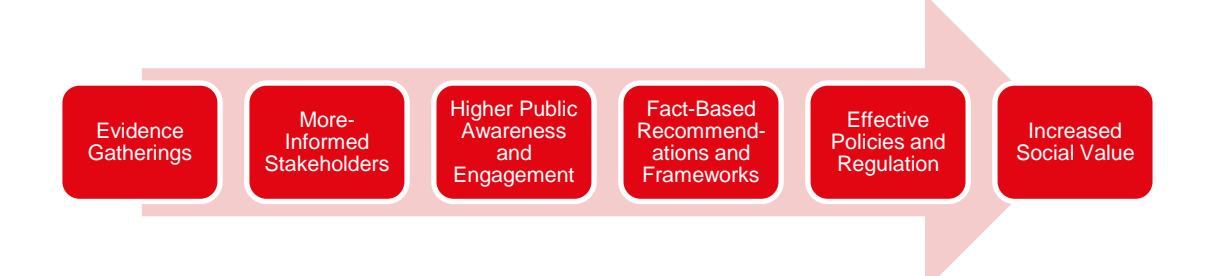
Figure 1. The Purpose of APPG AI

The first APPG AI Evidence Giving meeting approached Artificial Intelligence through a general lens, identifying the key issues within the umbrella term that stakeholders should focus on. The second APPG AI Evidence Giving meeting deep dived into issues regarding decision-making and AI - and addressed controversial questions such as: 'how can AI assist the decision-making process?' and 'where should we draw the line?'